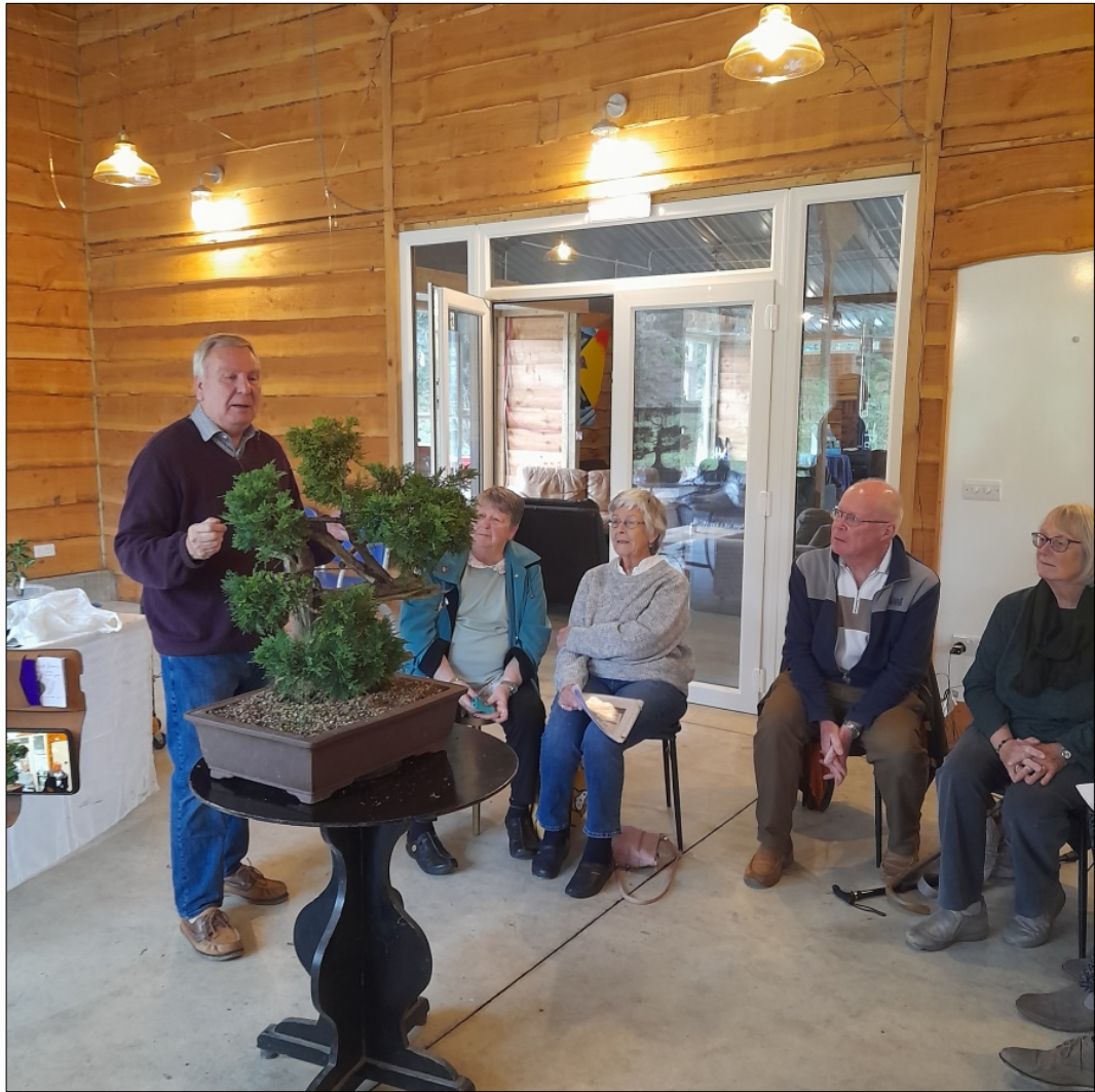
The Juniper being shown at the October meeting

Our next meeting is on 1 November at the usual venue of Venn Valley Vineyard @ 2:00pm.